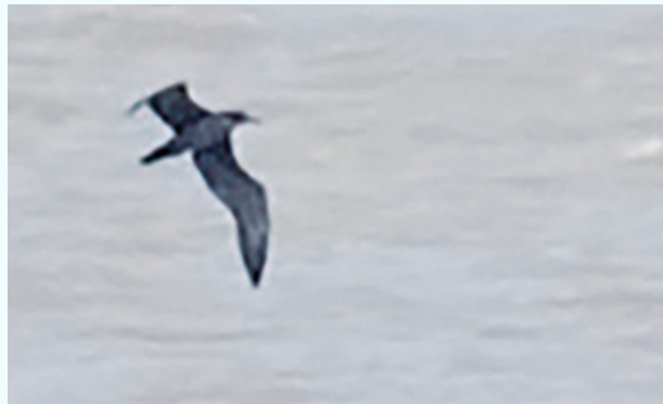
Wedge-tailed Shearwater - Recovered on 26.5.2021