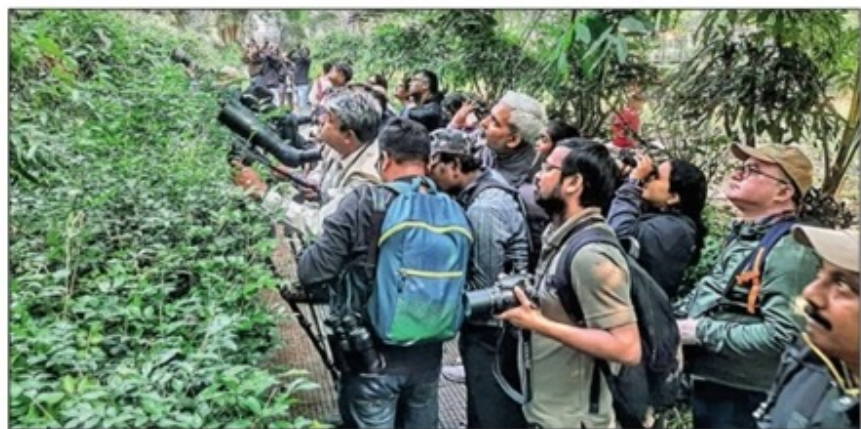
The group walks through Rabindra Sarobar on Sunday

Our first Bird Walk for Public Education was held in Rabindra Sarobar on 4th Dec, 2022. Several children and their parents and teachers joined in too for the inaugural walk. The event